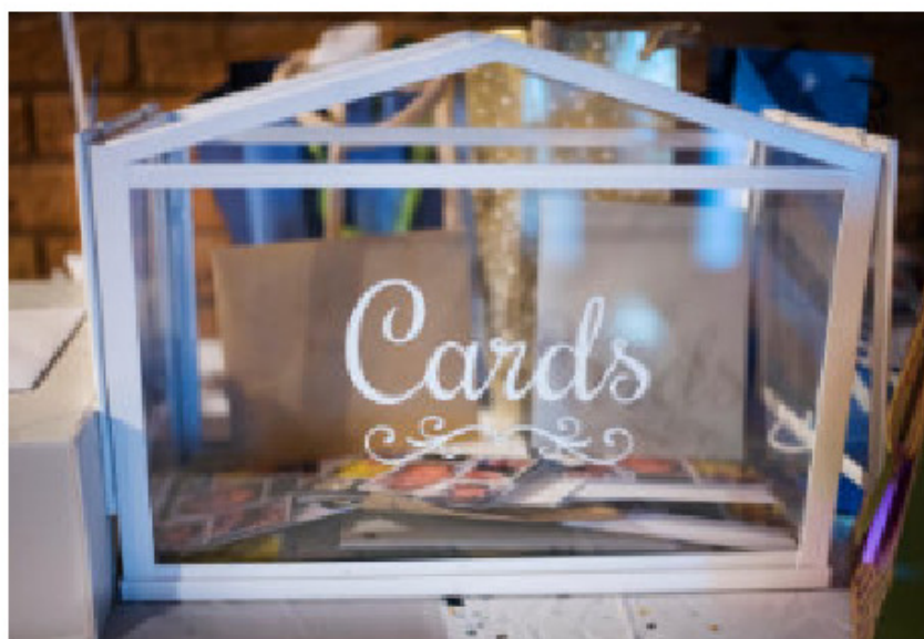
'Birthday Cards and Memories'

Guests were seen writing away and the postcards were then posted into a glass container with many other birthday cards, set on a table spread out with presents.