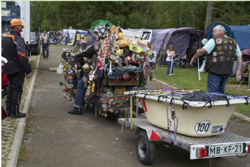
Dutch Kitchen Sink and Bath'

More holiday news next month. Until then - how many days to Christmas?