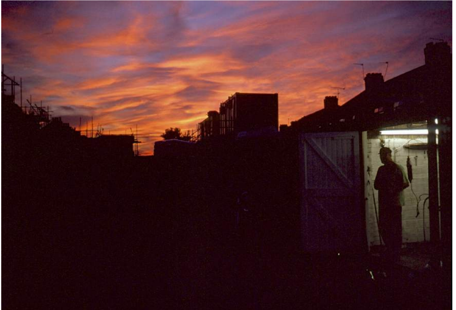
Sun Goes Down on Old Garage Workshop