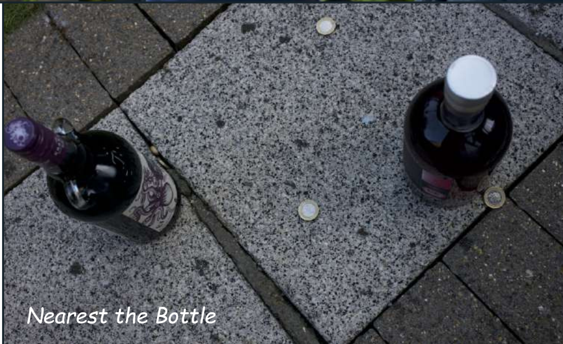
Nearest the Bottle