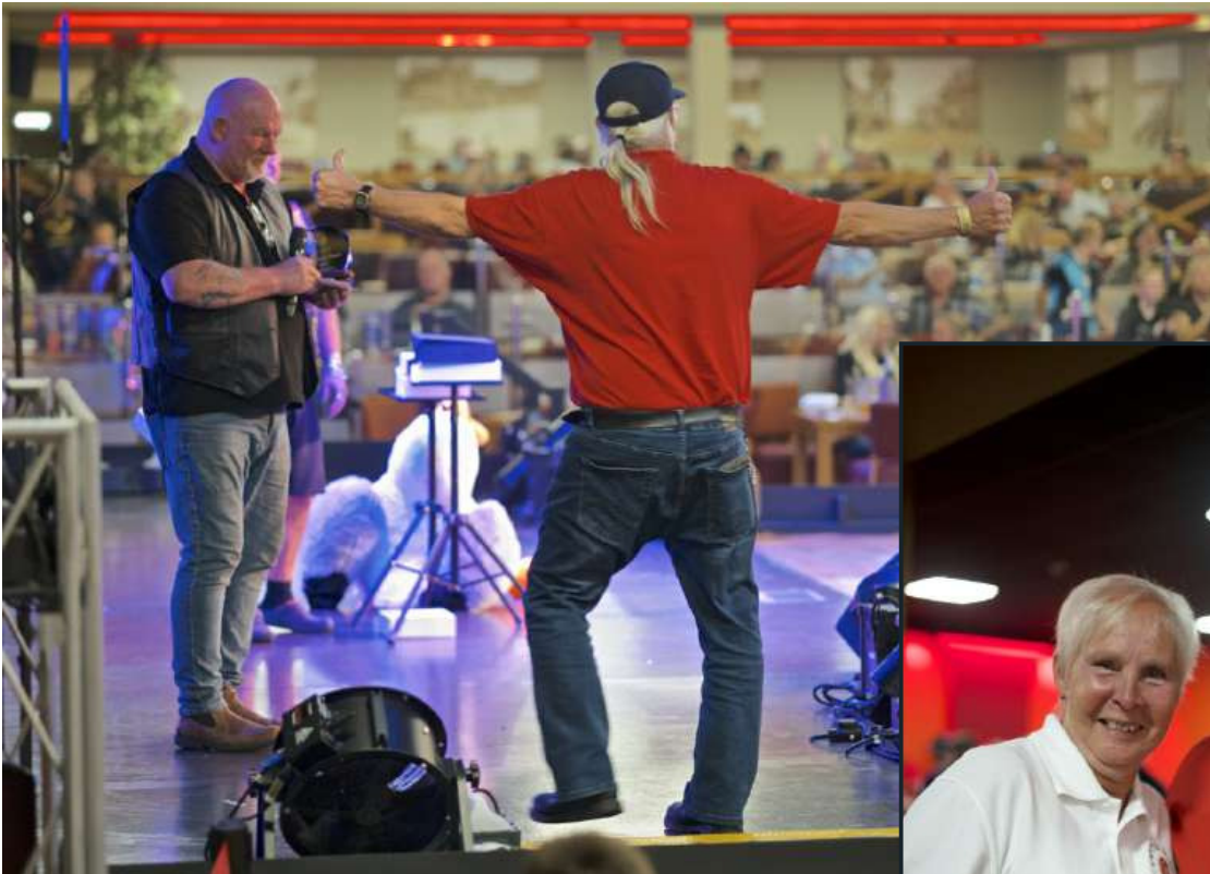
Capital Number One