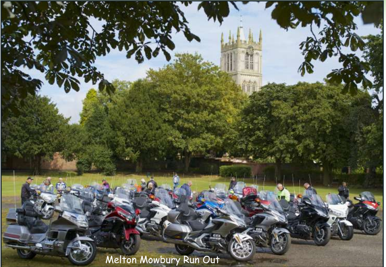
Melton Mowbury Run Out