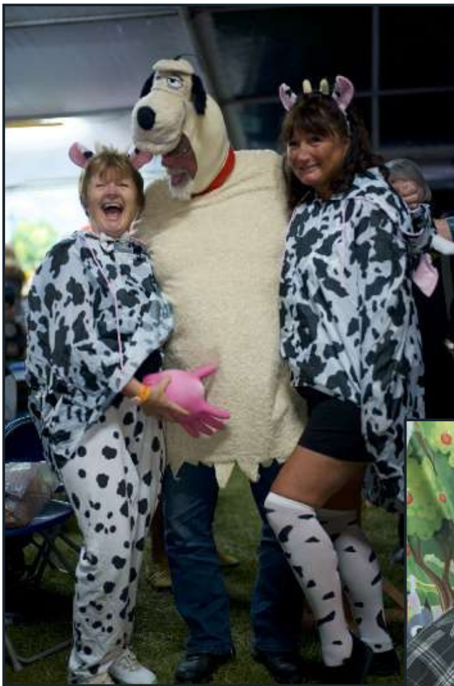
Silly old Moos ▲