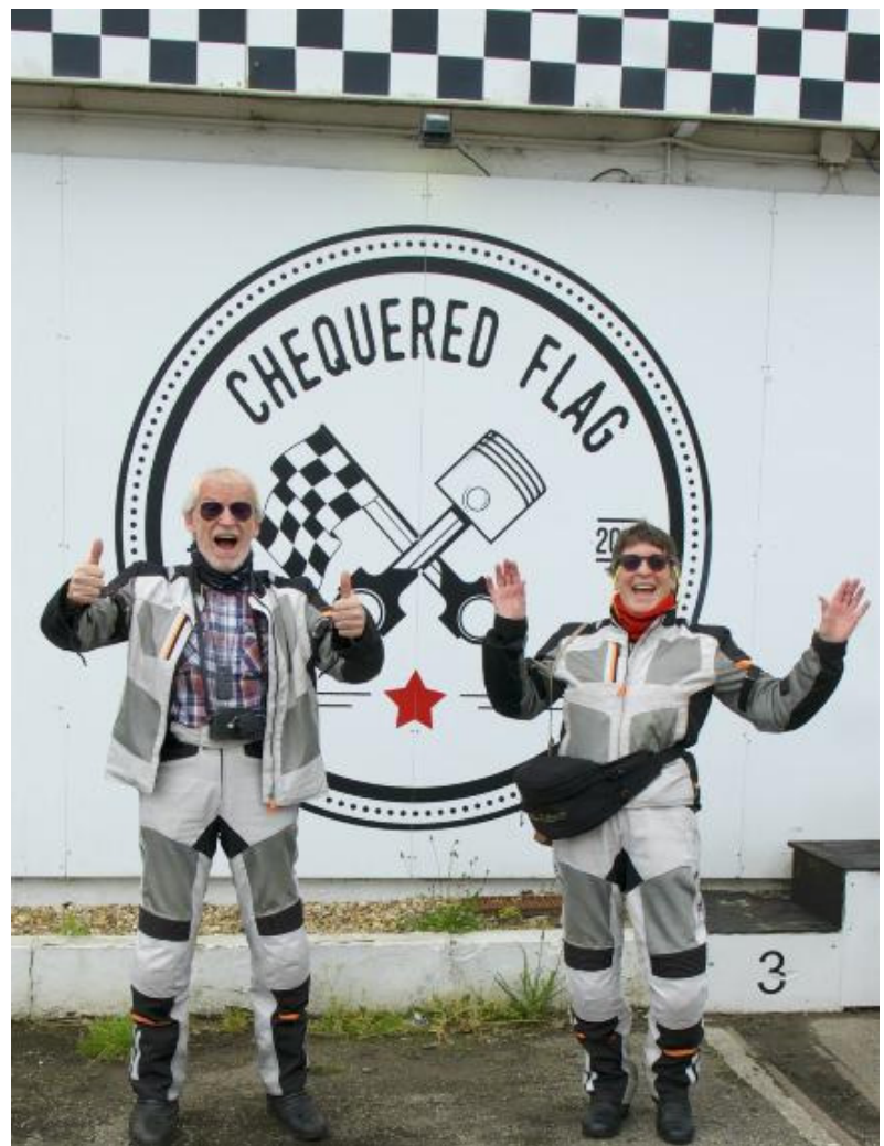
Our Twentieth Chairman's Challenge Cafe