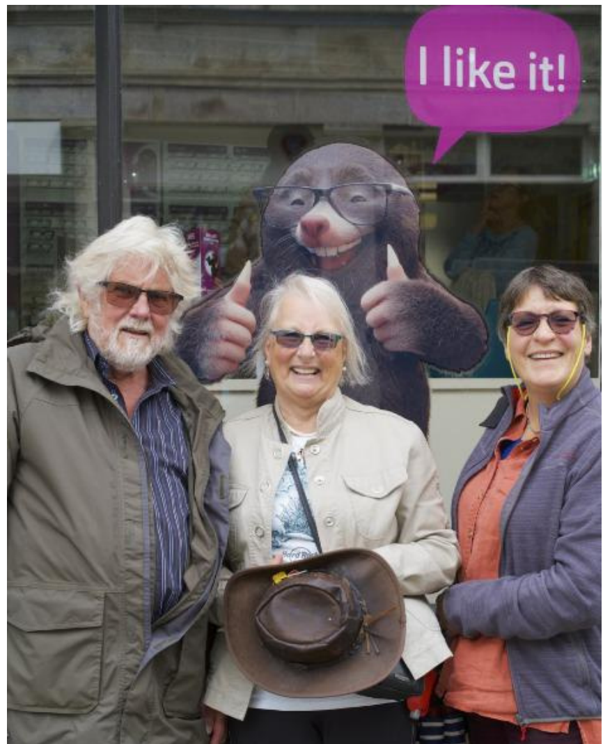
Four Moles In Tavistock