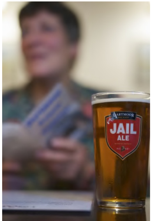
No Prisoners Here