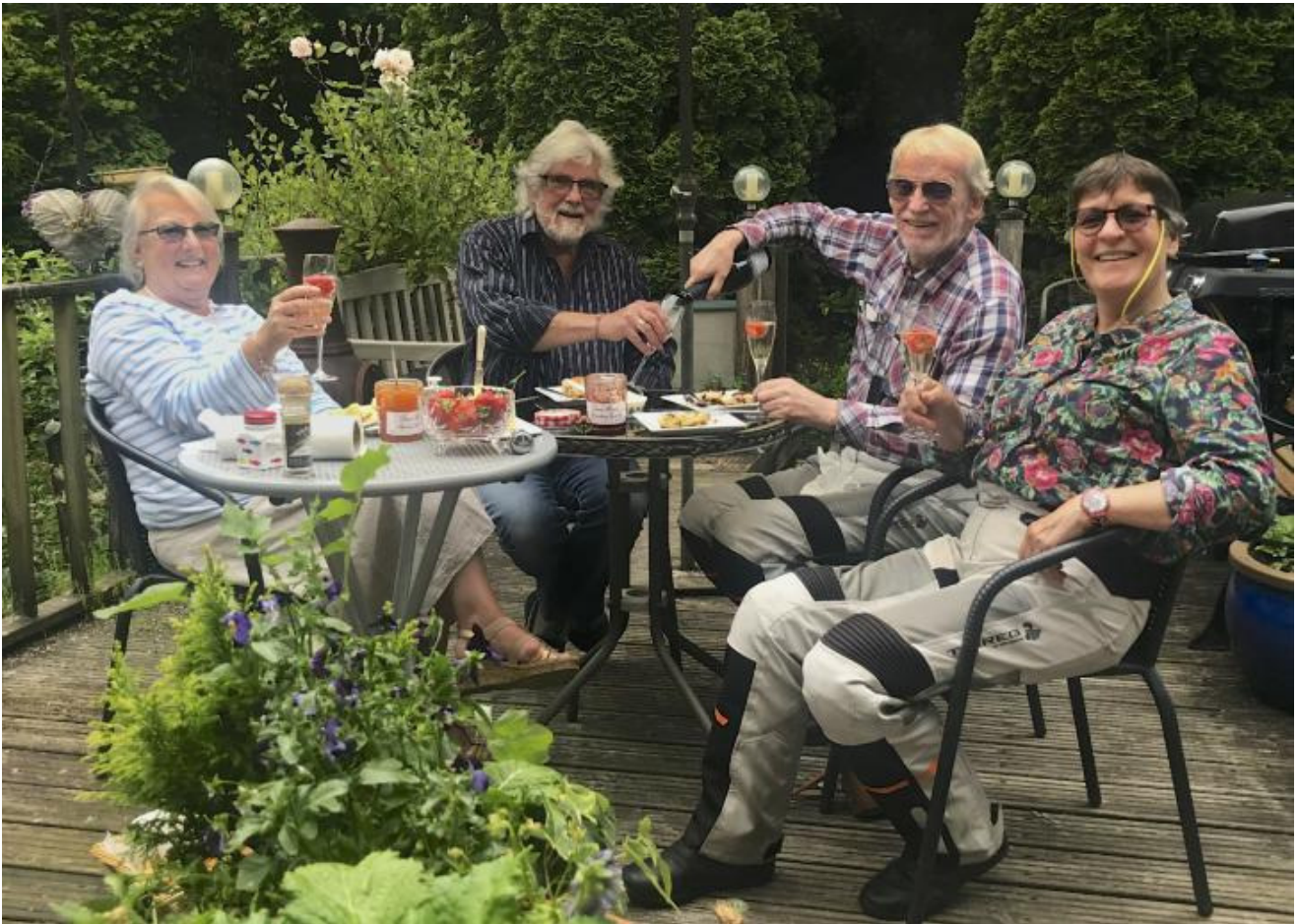
Devon Cream Tea Celebration