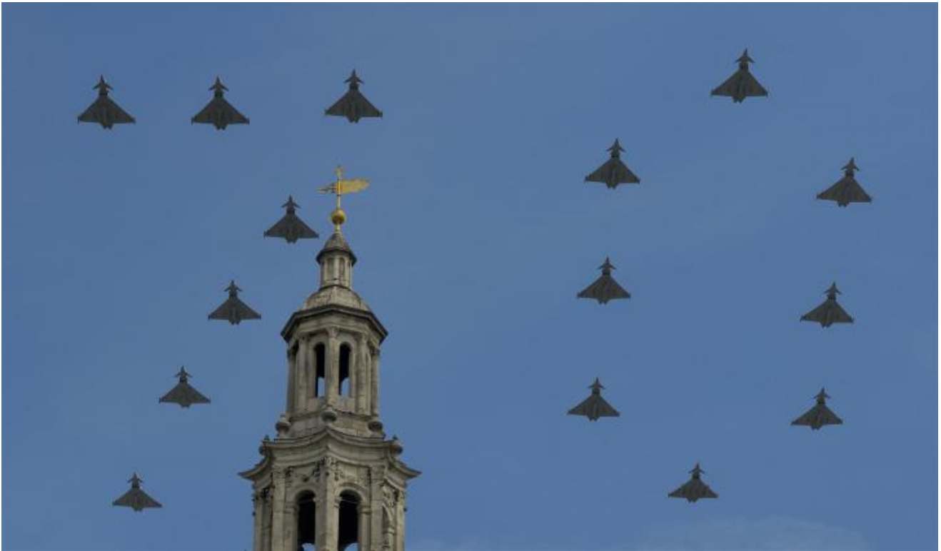
Seventy Glorious Years