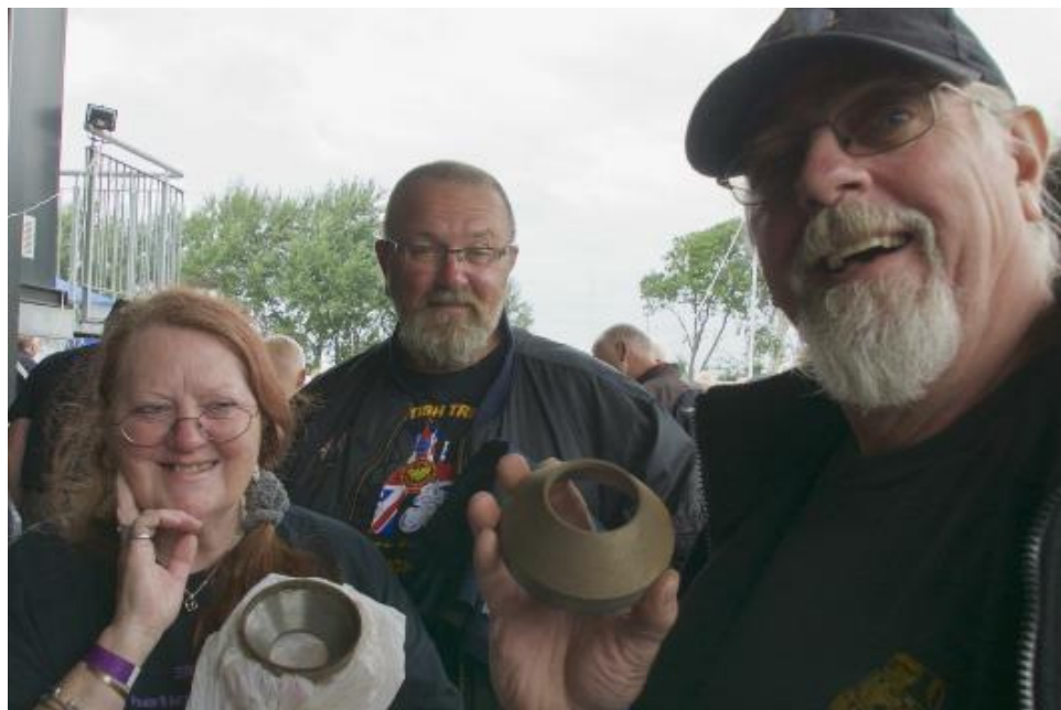
Yetti's Top-Box Find

A few of us bought some useful goodies at the Top Box sale on Sunday - this continues to be really popular and long may it continue.