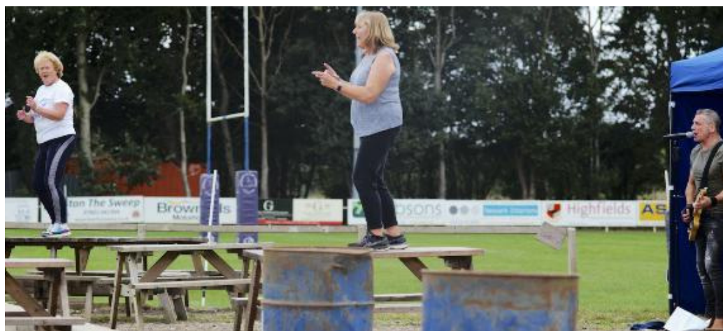
Sunday Afternoon Entertainment 1