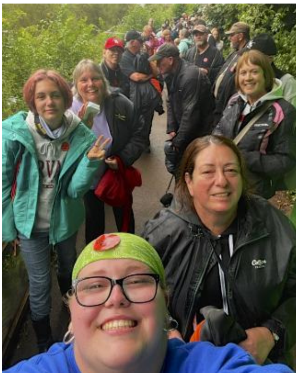
Head of the Wookey Queue

The campsite itself was spacious and quiet and great to get back to after days out exploring the surrounding areas. Evenings were spent around the fire pit reminiscing, having a drink and having a laugh. Day trips included a very interesting visit to the Sammy Miller Motorcycle museum, Swanage and a visit to Wookey Hole Caves and Cheddar Gorge, returning to the campsite via the New Forest. The wild horses were true to form through the New Forest.