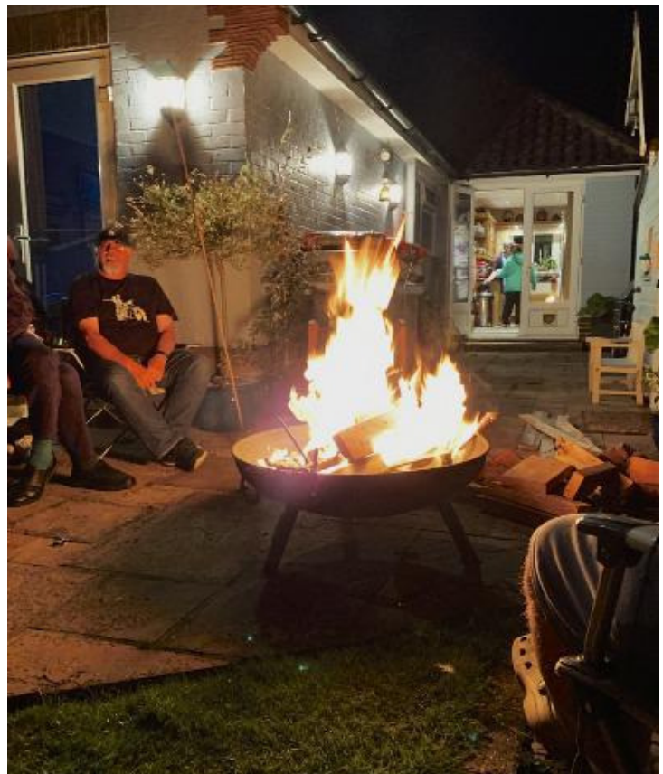
What A Sizzler