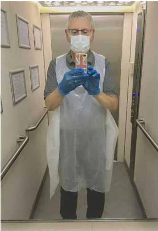
Just Another Day at Work