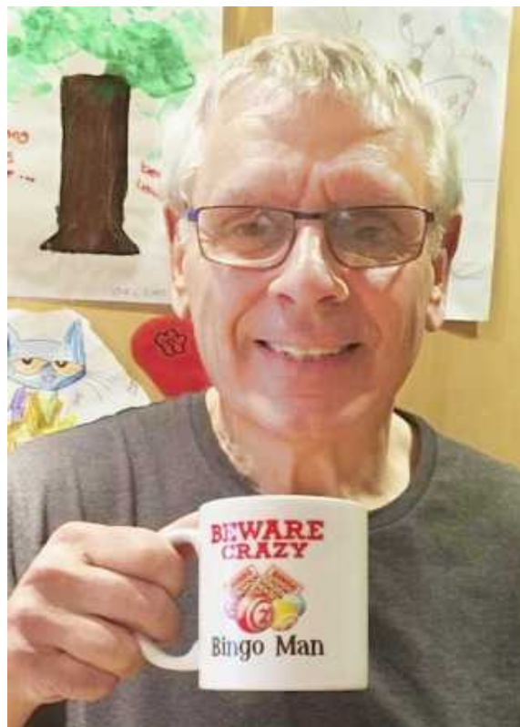
Full House Joe