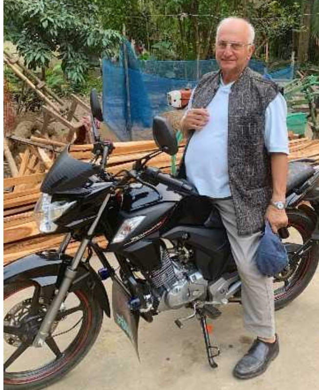
My Goldwing has Shrunk